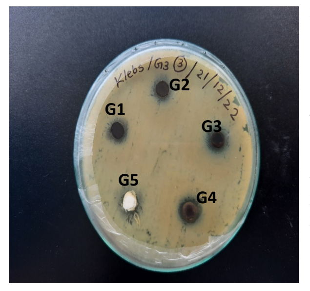
Figure 1. Inhibition zones of Klebsiella pneumoniae with 40 mg/ml concentration of G1: Pure CuO, G2: TiO_2 :CuO (1:1), G3: TiO_2 :CuO (1:2), G4: TiO_2 :CuO (2:1), G5: Pure TiO_2 using well diffusion method