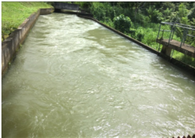
Fig. 4 Head raised canal.

the unpopulated catchment area, the water quality has ensured a better quality. Figs. 2 and 3 show the intake weir during the dry and wet weather periods,