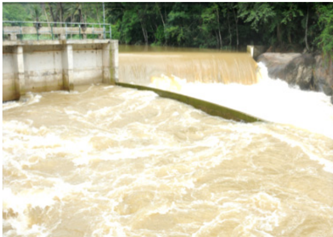
Fig. 3 Intake weir during a wet day.