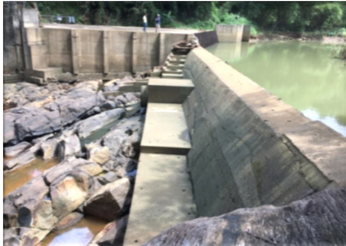
Fig. 2 Intake weir during a dry day.