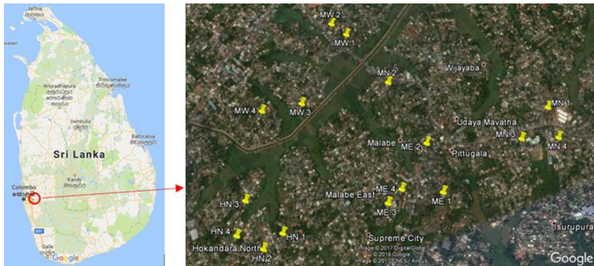
Figure 2 Sample locations